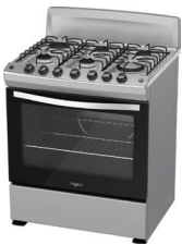
APPLIANCES & SCRAP METAL

Below are common hard-to-recycle items. Check the app for comprehensive recycling, reuse & repair options.