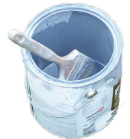
HOUSEHOLD HAZARDOUS WASTE